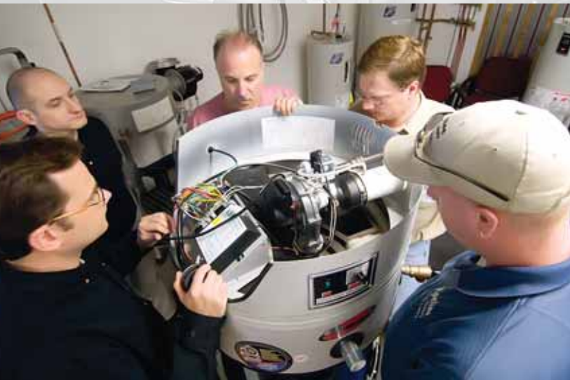
Explaining the operation of a Bradford White water heater.